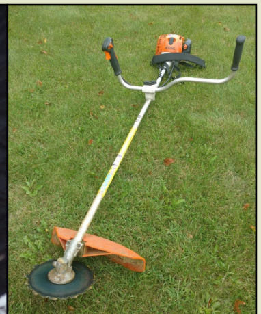
Brush saw can be used to cut small diameter buckthorn.