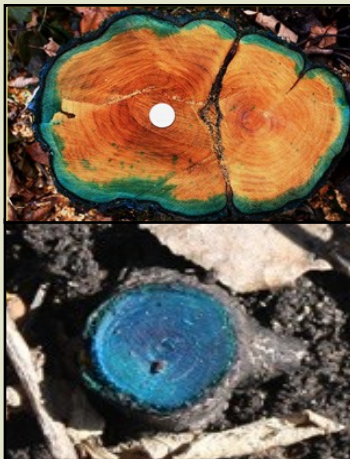
Apply herbicide to the outer ring of living cambium.