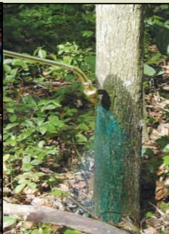
Basal bark spray around the entire trunk of the tree.