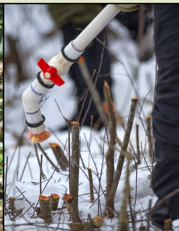
Use a 'kill stick' for basal bark or stump treatment.